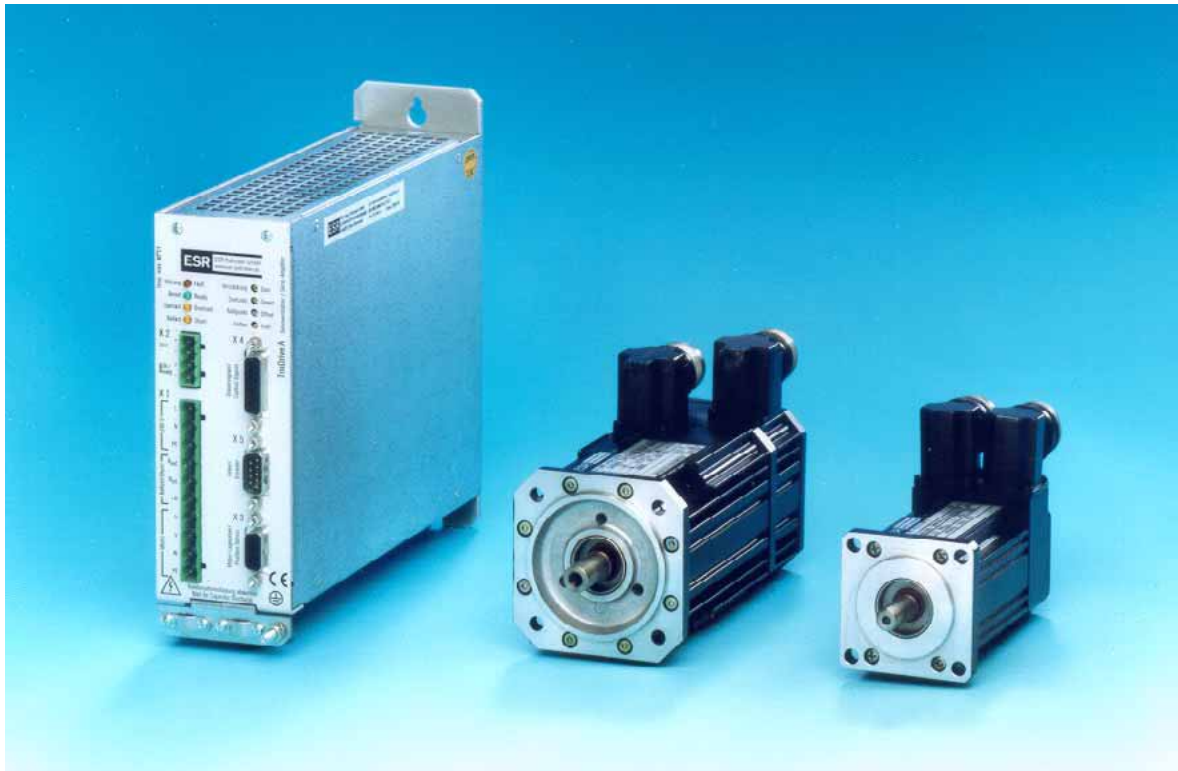
Components of the TrioDrive A servo drive family: BN 6651 servo drive (2 A), MR 4104 and MR 4045 motors

Analog AC servo drive systems with sinusoidal commutation Servo drives in compact design, 230 V AC mains connection Servo motors with high power density up to 5.0 Nm / 1.1 kW