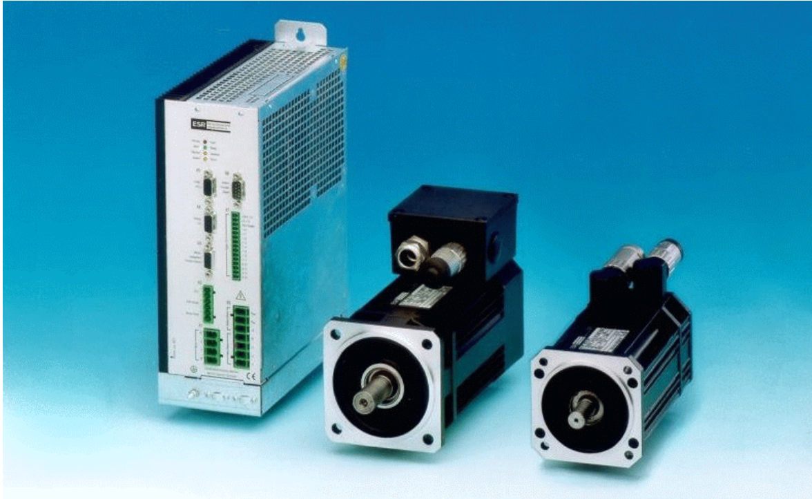
Components of the MidiDrive D servo drives family: BN 6742 servo amplifier of medium power (4 A), MR 4208 motor (3.4 Nm at 3000 r.p.m.), MR 4608 motor (3.5 Nm at 6000 r.p.m.)

Digital AC Servo Drives with Direct Mains Connection 3 × 400 V AC • Motors up to 17 Nm / 4.2 kW Integrated Positioning Control (Option)